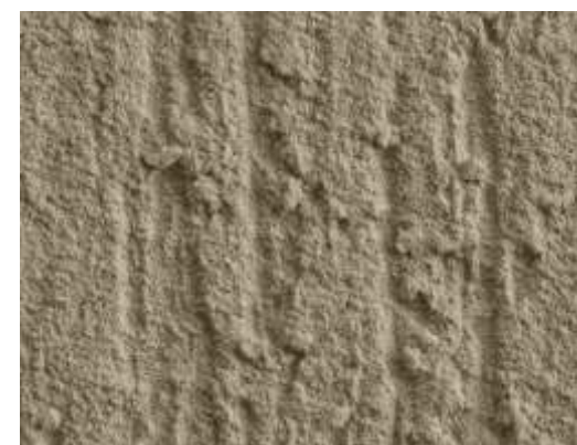
DRAPANA 3,0 mm