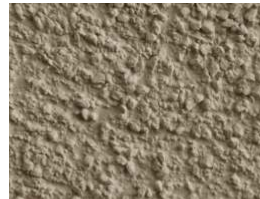
BARANEK 3,0 mm