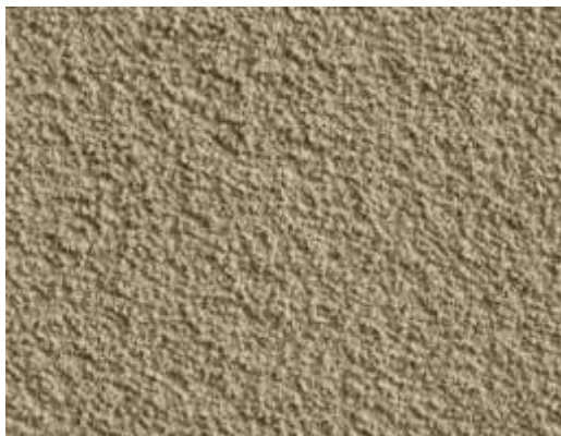
BARANEK 1,0 mm