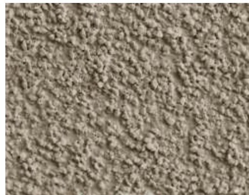
BARANEK 2,0 mm