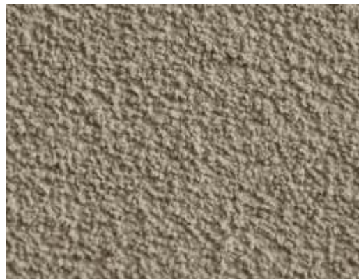
BARANEK 1,5 mm