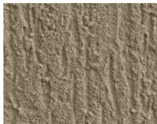
DRAPANA 2,0 mm